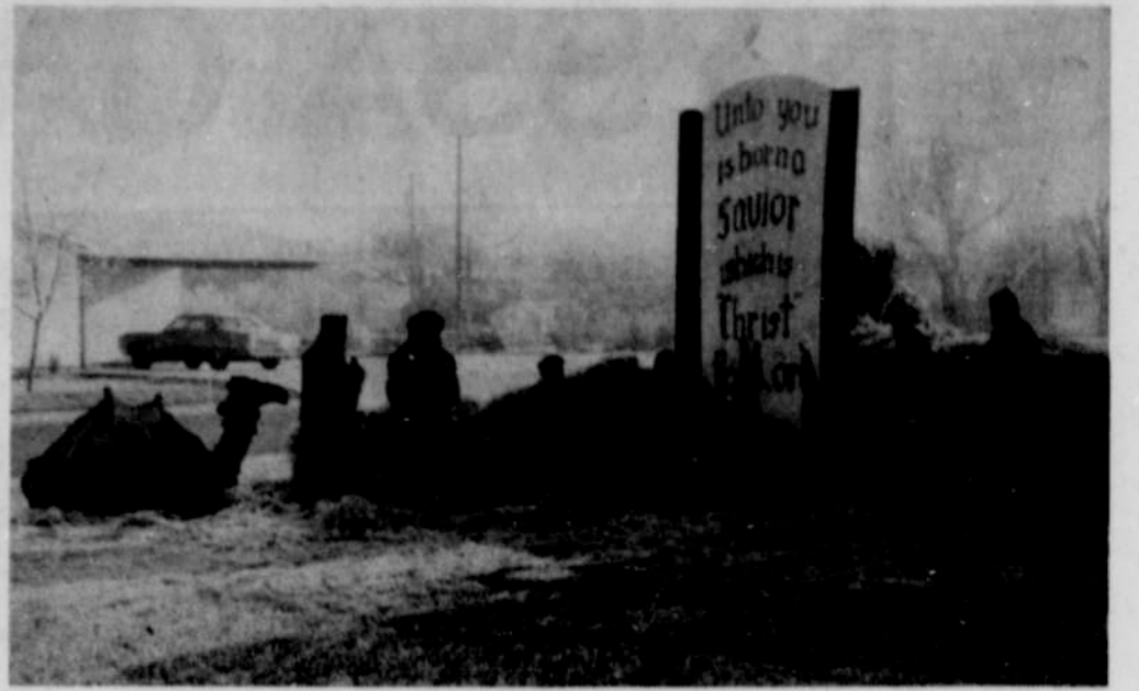
REAL MEANING OF CHRISTMAS —The manger scene on the Faith Lutheran Church grounds on 5th and Park Avenue.

Wednesday, December 29, Bible Study and Prayer Meeting, 7 p.m.