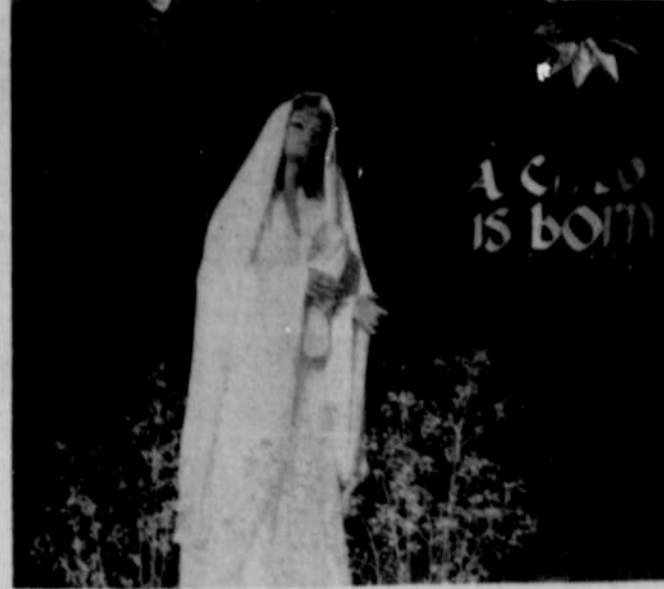
A CHILD IS BORN - This is just one of the many beautifully decorated windows in downtown Nyssa and can be seen at Wilson's Department Store. Wilson's received honorable mention in the recent Christmas window contest, sponsored by the Chamber of Commerce.

*** "A tottering civilization needs a towering Saviour."