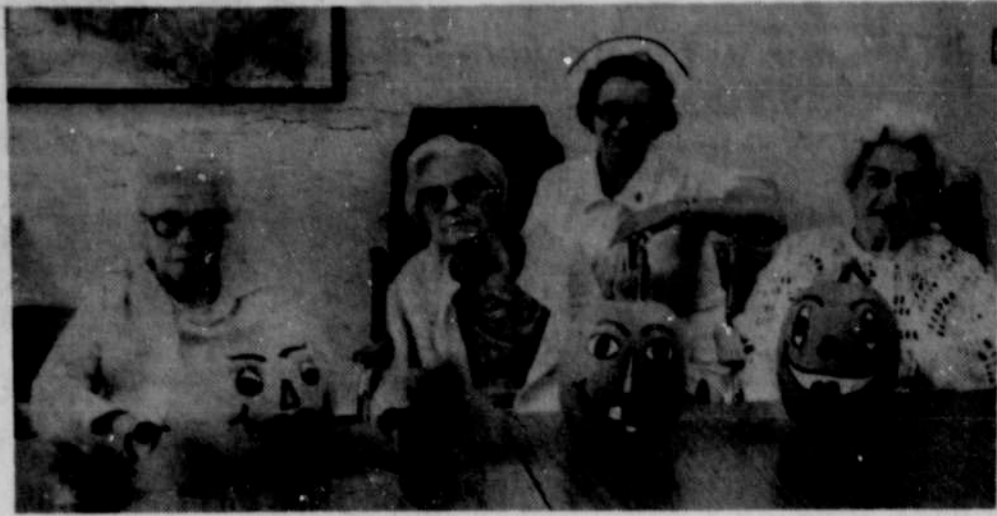
NURSING HOME RESIDENTS AT Malheur Memorial Hospital enjoyed a Halloween Party, hosted by the Adrian Garden Club women last Friday. Pumpkins were decorated