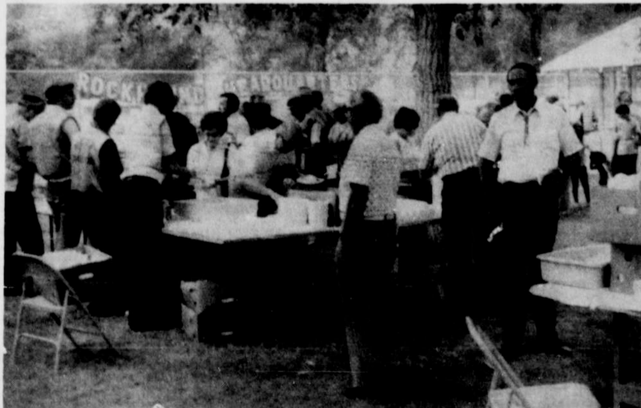
THE LIONS CLUB BARBECUE last Thursday evening was again one of the highlights of Thunderegg Days. Over 600 persons were fed in South Park, with visitors and townspeople

This 16" line was three-fourths full of silt, leaving only 4 to 5 inches of freeboard to