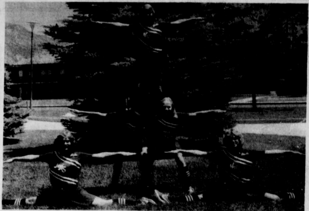
THESE FIVE NYSSA cheerleaders recently spent four days at a cheerleader camp in Logan, Utah, where they learned new cheers and competed with other cheerleaders. They are