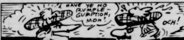
"Rumplegumption" is the Scottish word for common sense.

On July 4 and throughout this year let us make a special effort to remember that the preservation of freedom is the responsibility of each of us, and let us instill this understanding in our children. The strength of our liberties lies not so much in our arms as in the value we place on freedom, and this strength can and must be renewed in us from time to time, and passed on to each succeeding generation.