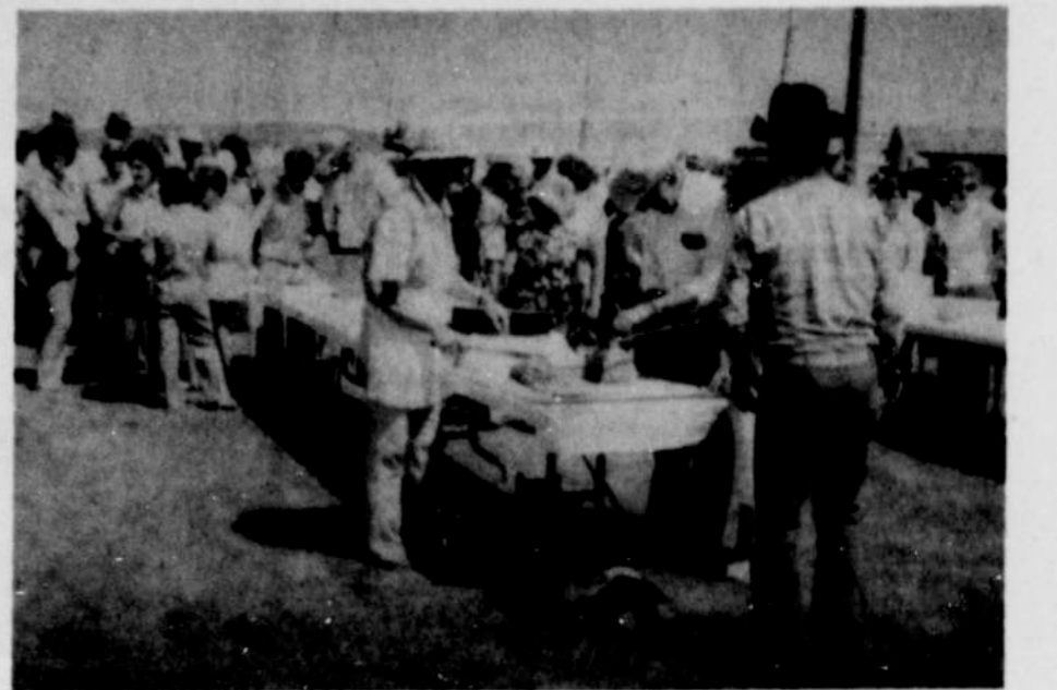
PART OF THE CROWD OF 1300 who attended the Top Op Tour Saturday is shown and the beef was cooked in pits by Jordan Valley residents. The lunch was served by members of the Ontario and Nyssa Chambers of Commerce.