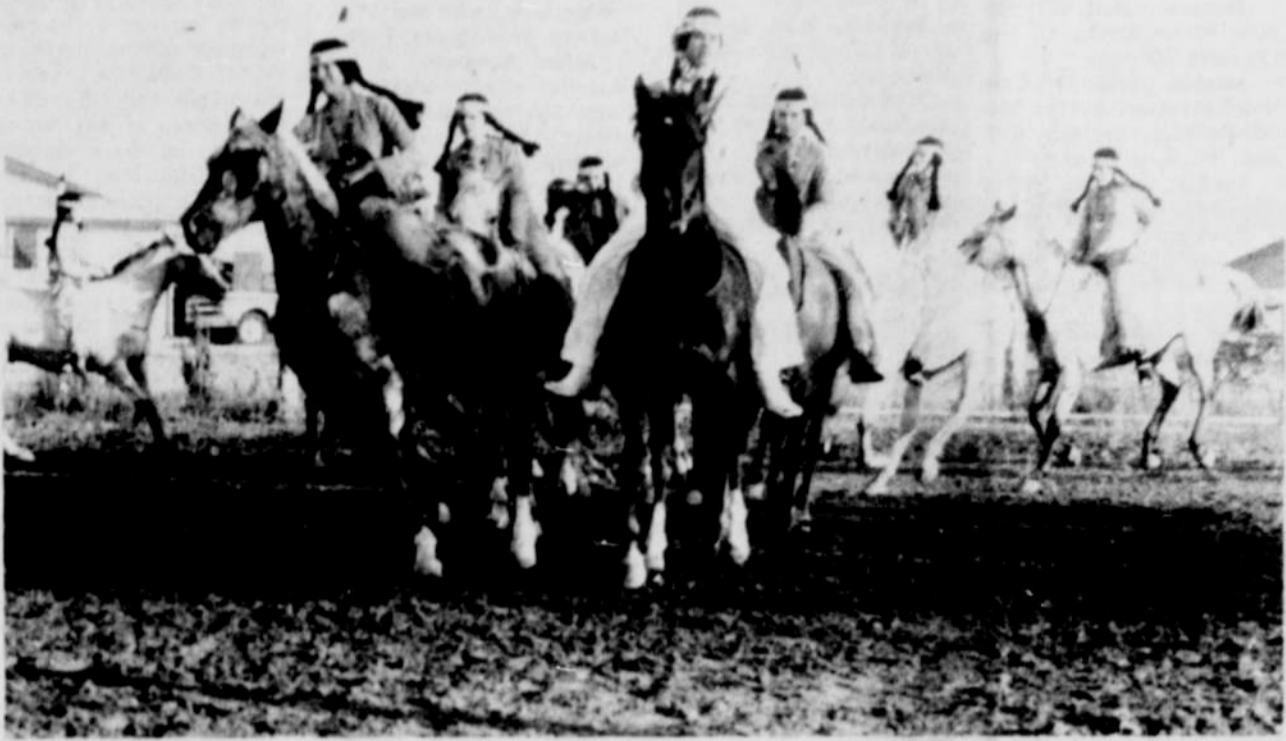
THE "BAREBACK RIDERS OF BOISE VALLEY" a group composed of persons from the ages of 7 to 18 who ride to honor the American Indian, will be this year's featured attraction at Friday and Saturday's 30th Annual Nyssa Nite rodeo. Admission is $2.75 for adults, $1.25 for children ages 6-12. Children 5 and under will be let in free.

... Wouldn't you like to be able to say, "I remember when I donated my first pint of blood. It was June 22, 1976." New blood donors are very badly needed in our area. Old donors are much appreciated and needed also but they have established their pattern and can be counted on to give. Blood replacement is important and you never know when you or your loved ones may need some. Let's see how many first time donors we can add to our procurement list this June 22 at the Eagles Hall.