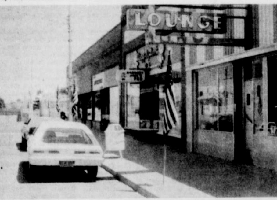
FLAGS ARE FLYING IN Nyssa in response to the 21-day celebration ending July 5. This nationwide observance will climax the 200th birthday celebration. Boy Scouts put out the flags, with merchants bringing them in at night and putting them out each morning for the three-week period. Home flags are also flying, as they are in every city in the United States.