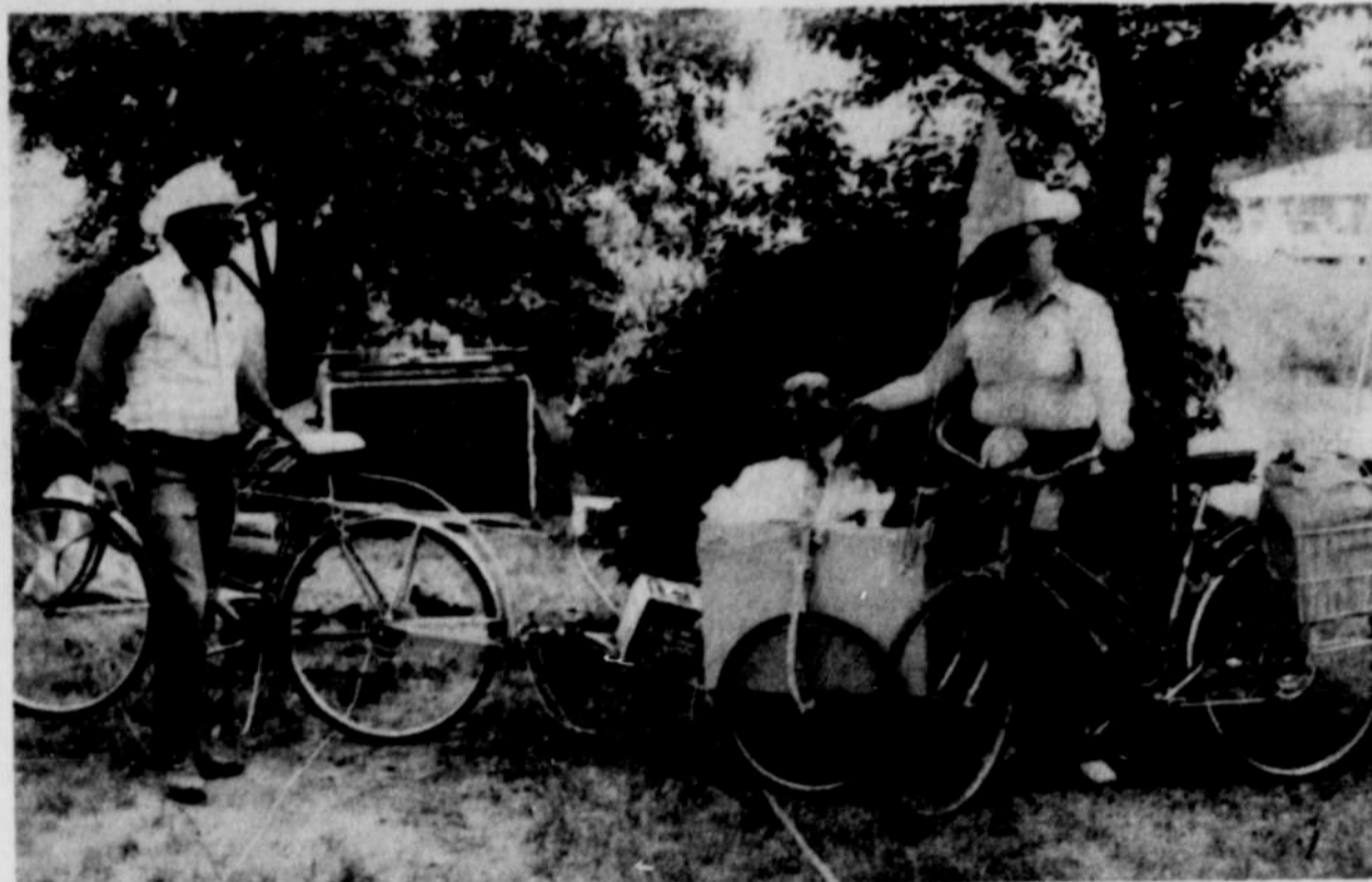
TWO NEARLY BLIND BICYCLISTS STOPPED OVERNIGHT in Nyssa with their dog Lightning, shown here in the backyard of the Walter Burdette home, where they camped Sunday night.

Just a reminder - Flag Day is Monday, June 14. Wouldn't you like to be different from most people that day? You can - just fly your flag! One of the most beautiful and memorable occasions that could happen to our town is for everyone to fly their flag at the same time on June 14. Couldn't we all think alike and be proud to wave our country's banner one day out of the year?