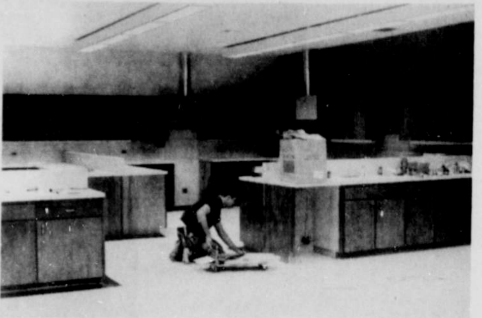
A WORKMAN IS LAYING TILE in the Home Economics room of the high school.