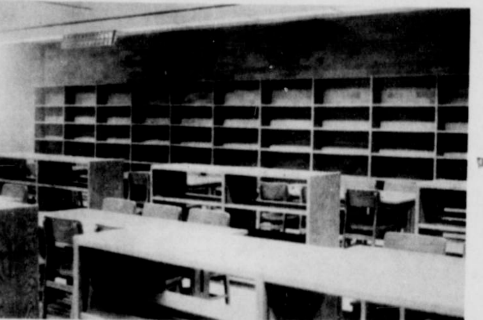
SHELVING AND TABLES in the new library are in place, and the carpeting has been installed.