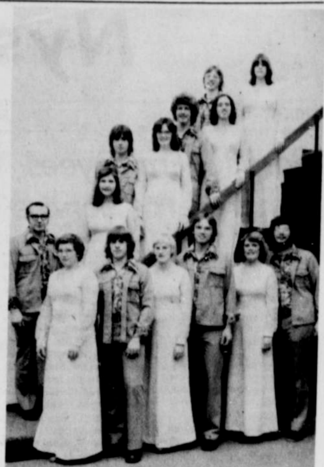
The OMNIPHONIC SINGERS, a specialty group within the Treasure Valley Community college Concert choir returned with the full choir for a home concert in April.

Saturday, May 15 - Missions Experience, 9:30 a.m. to 12 noon.