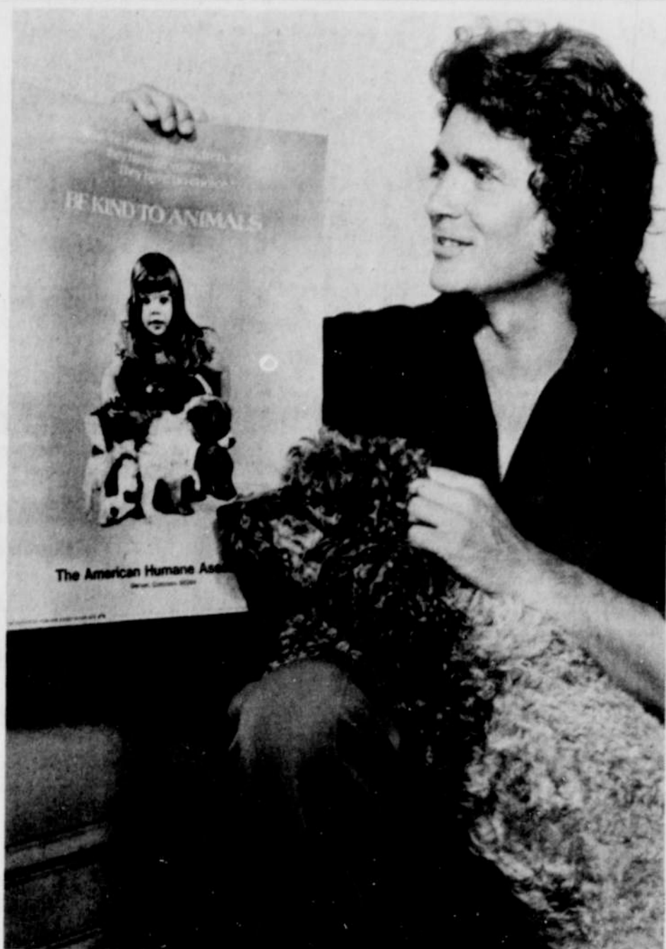
POOF, THE POODLE, takes particular interest in the Be Kind to Animals Week poster held by his master, television star Michael Landon, national Kindness Chairman for Be Kind to Animals Week. The event has been sponsored annually by The American Humane Association of Denver, Colorado since 1915. The dates this year are May 2-8.