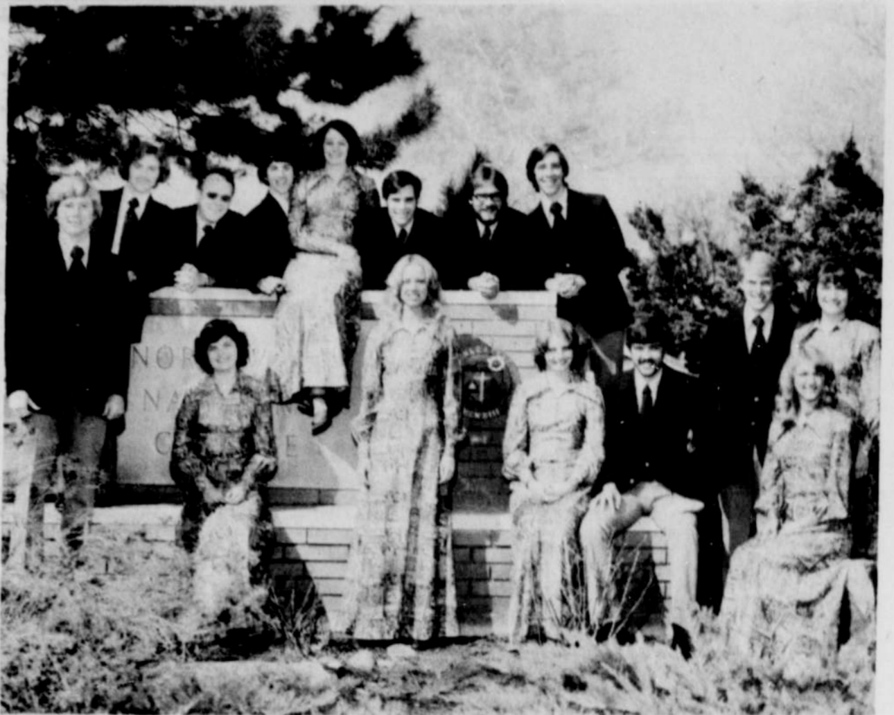
THE NORTHWESTERNERS FROM NORTHWEST Nazarene College will present a sacred concert this Sunday at the Nyssa Nazarene Church at 11 a.m.