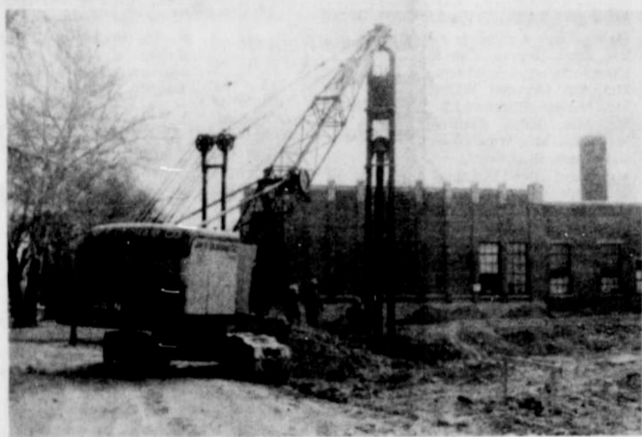
WALLS FOR THE NEW HIGH SCHOOL The walls for the new high school are rapidly taking shape, and building activity is heavy throughout the entire campus as work is proceeding on all of the new buildings.