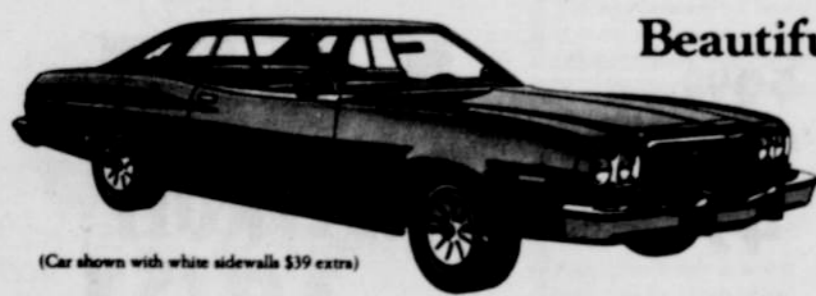
(Car shown with white sidewalls $39 extra)

*Based on manufacturer's suggested retail price (Car shown with white sidewalls $13 extra)