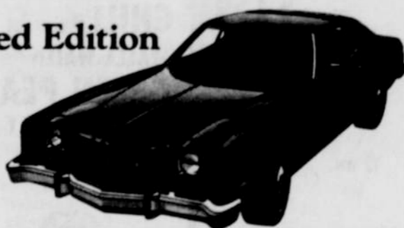
(Car shown with white sidewalls $39 extra)

Includes: Elite standard equipment such as vinyl roof, twin opera windows, automatic transmission, power steering and brakes, etc. Plus unique wheel covers, special bench seat and trim, special door trim panels, selected matching cloth and vinyl interiors, but excluding wheel lip moldings, door carpet and deluxe steering wheel. Quantities are limited.