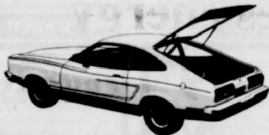
Limited Edition Mustang II 2+2