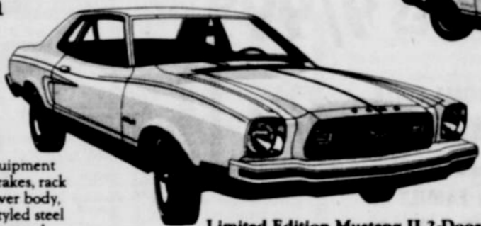
Limited Edition Mustang II 2-Door

Includes all Mustang II standard equipment such as 4-speed stick shift, front disc brakes, rack and pinion steering. Plus two-tone lower body, bodyside stripe, unique seat inserts, styled steel wheels, trim rings, brushed aluminum panel applique. Quantities are limited.