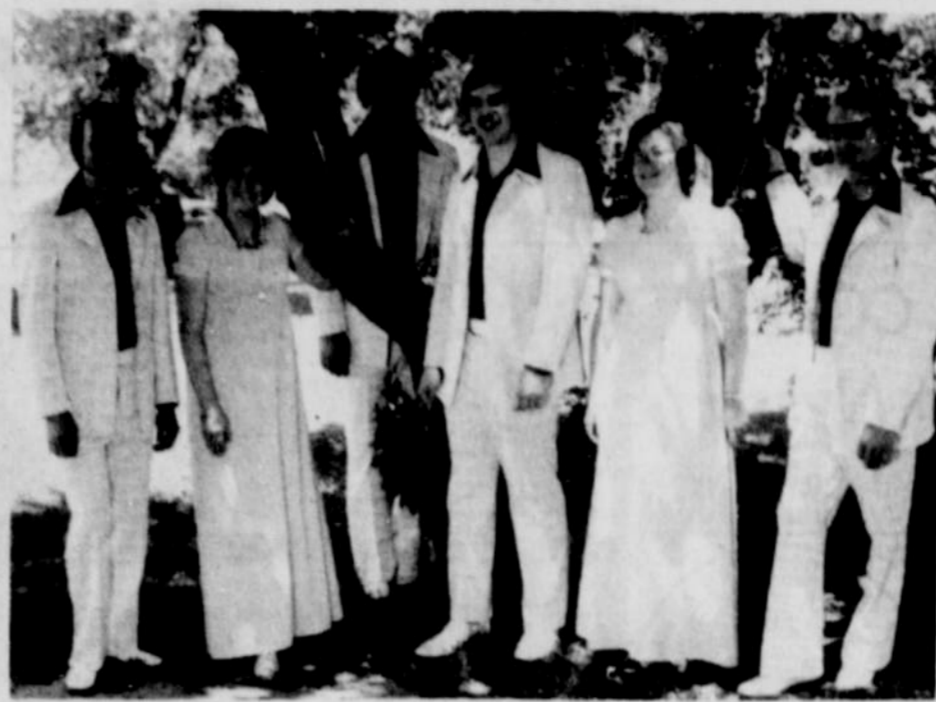
THE INNER LIGHT, gospel singing group will be appearing at the Assembly of God Church in New Plymouth, Sunday, January 11, at 7 p.m.