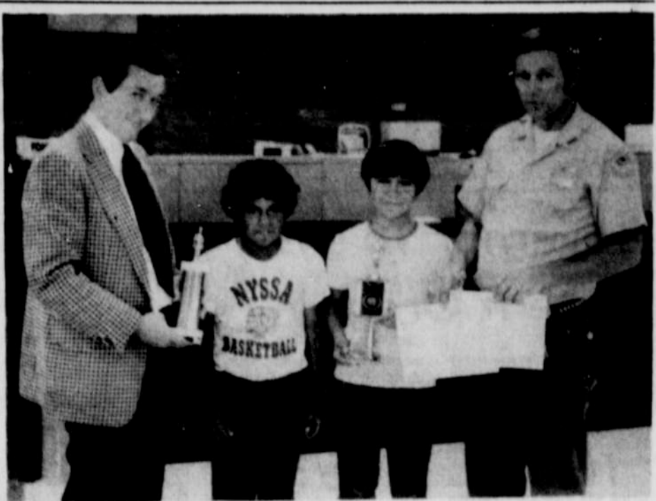
TRAVELING TROPHIES will be presented each month by First National Bank of Oregon to the outstanding School Patrolmen of the Month.

Wednesday - Bible study and prayer, 8 p.m.