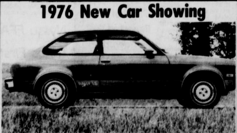
1976 New Car Showing