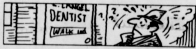
Courage is - Doing what you are afraid to do. There can be no courage unless you're afraid.