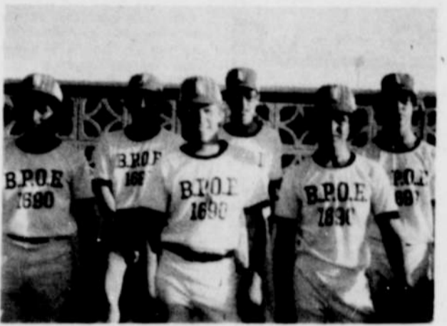
MEMBERS OF THE SRV #2 BABE RUTH TEAM are:

The SRV #4 team lost their first game to Baker but then beat Wallowa Valley, Redmond and the SRV #3 team played the SRV #1 team to see who would have a chance to face Baker for the championship game Tuesday. The SRV #1 team won 10-0 so they will be in the finals.