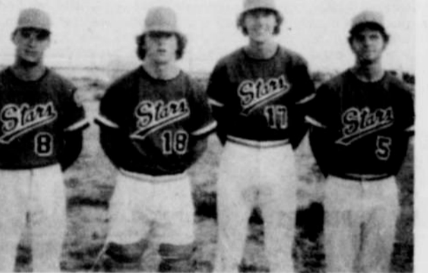
THE AMERICAN JR. LEGION BASEBALL TEAM advanced to the Area playoff by defeating Vale 3 out of 3 times played.