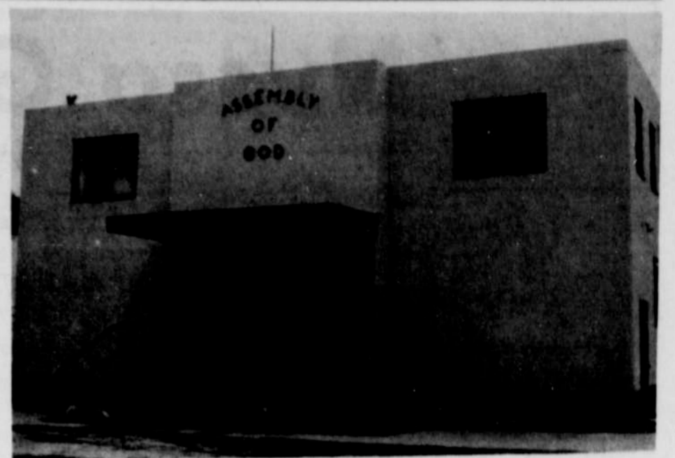
Assembly of God Church