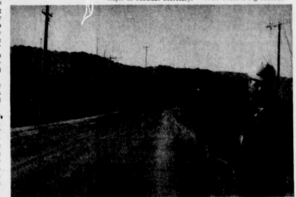
THE STATE HIGHWAY DEPARTMENT is widening State Highway 201 between Owyhee Junction and Adrian. This picture taken Tuesday shows the crews working in

Grab your walking shoes and plan on walking in the May 10 Walkathon. For those who can't walk, why not sponsor someone who can? Help to make this very worthwhile event a big success.