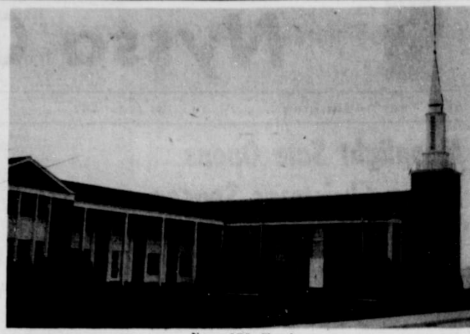
Nyssa LDS Church

We wish to thank all who donated cookies for the men in the Boise Veterans Hospital. The American Legion Auxiliary.