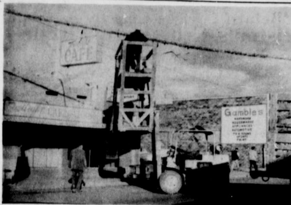
NYSSA STREET DEPARTMENT EMPLOYEES put up the Christmas lights and candy canes last week in preparation for the holiday season. Merchants will kick-off the Christmas season with a moonlight sale, parade, Santa Claus and free refreshments for area citizens Friday evening.