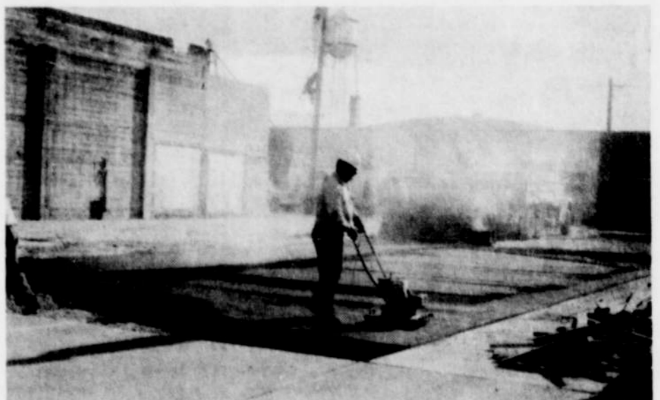
CREWS COMPLETED PAVING the First National Bank parking lot Tuesday. Several unpaved areas have been left, such as in the foreground, where plantings will be made. Bracken's building in background will

Closure notice will be posted at the Succor Creek—Leslie Gulch road junction. The road will be accessible in the early spring or whenever weather conditions allow, Schneider said.