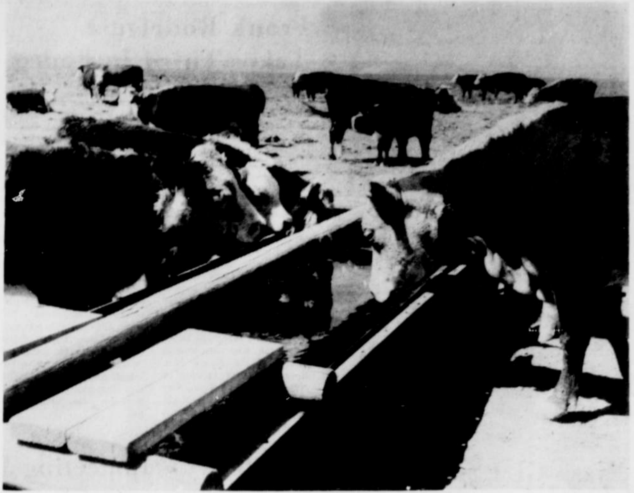
Some of The More than 300,000 Head of Livestock which are grazing on the National Resource lands in Oregon. These livestock are authorized under the provisions of the 1934 Taylor grazing Act, a law which is 40 years old June 28, 1974.