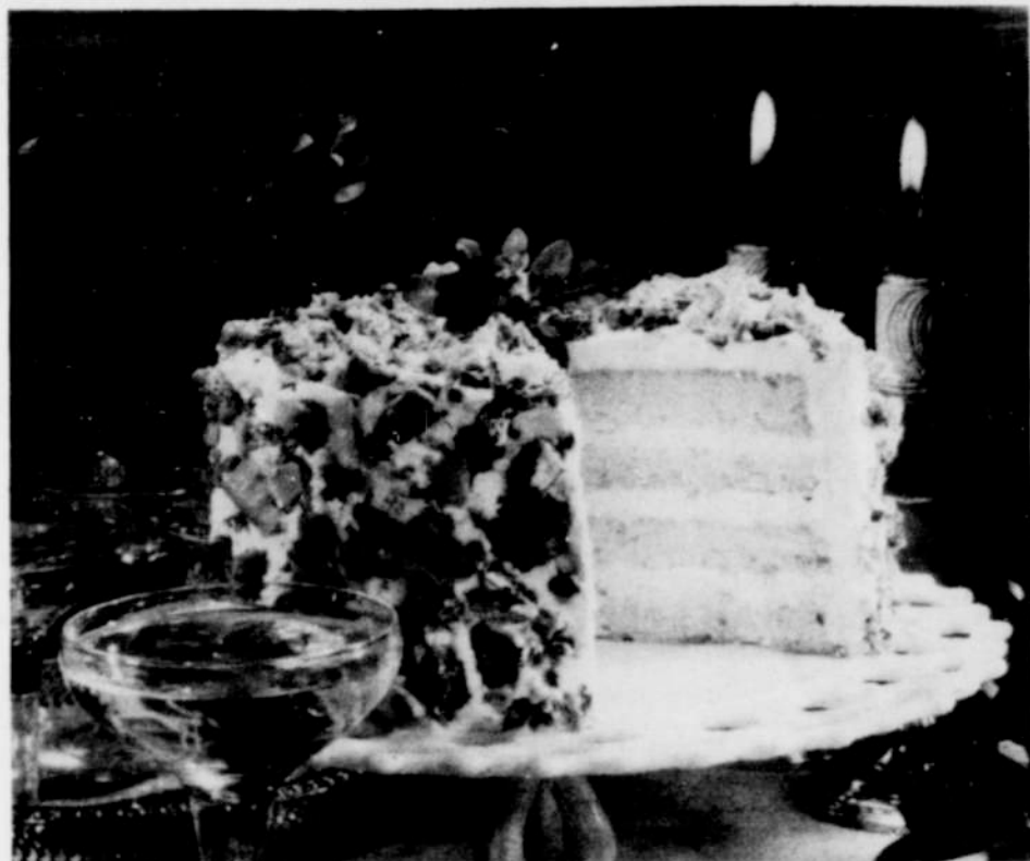
Homemade butter cake done in four layers with whipped frosting