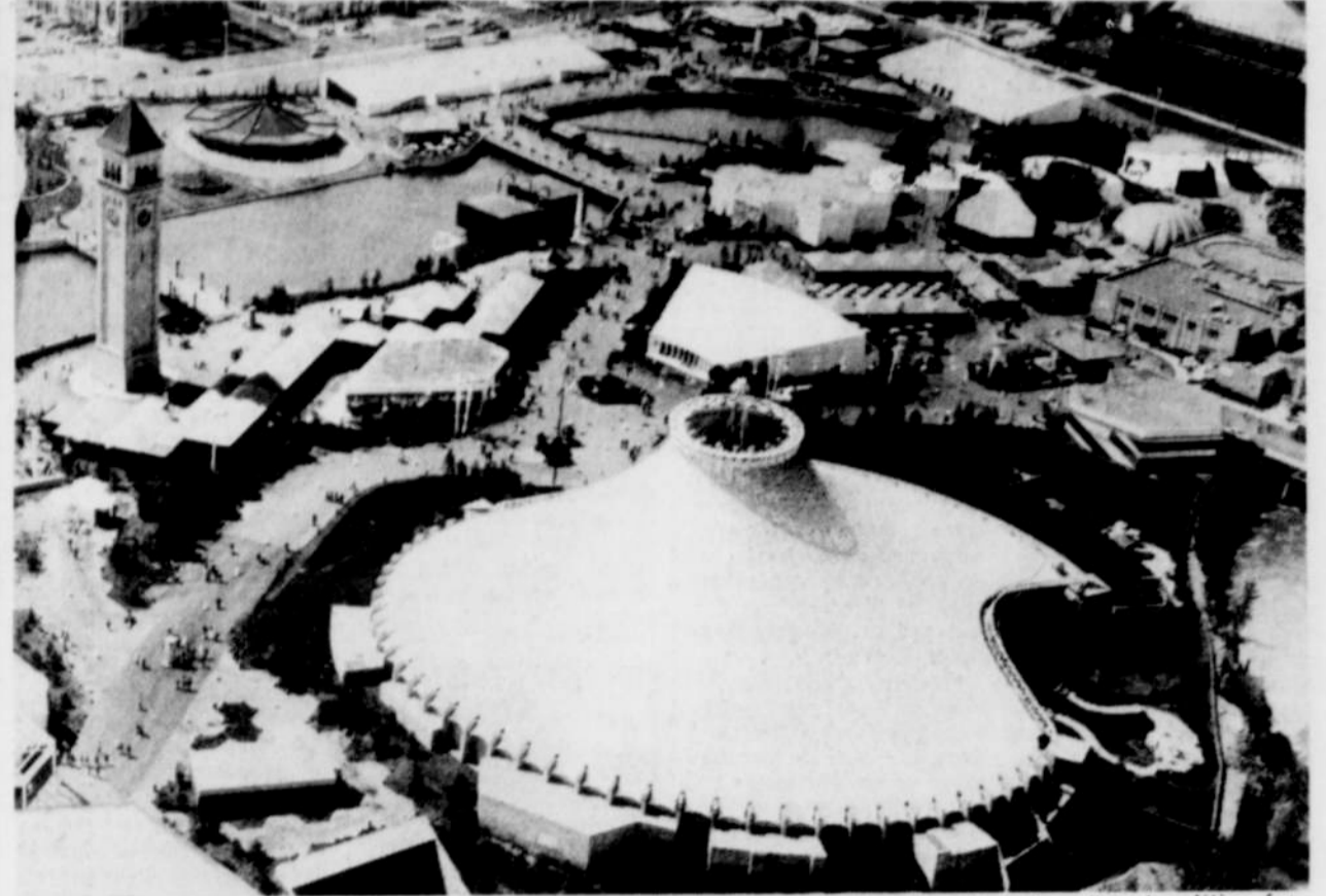
AERIAL VIEW OF THE SITE OF EXPO '74. Pictured is Havermale Island in the Spokane River. Dominating the photo is the vinyl canopy of the U.S. pavilion. To the left is the Great Northern railroad tower, the only structure to remain on the site after demolition for Expo. Above the U.S. pavilion is the Republic of China pavilion. Above that, is Japan's pavilion. Expo opened May 4 and runs through November 3.