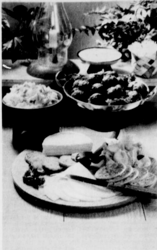
INTRODUCE NEWNESS TO HOT AND COLD patio party nibbles with dairy foods.

Summer is a good time to rejuvenate ideas you routinely pull out every time company comes. Without going a step further you can have some tasty combinations with just a tray of cheese and crackers. Perhaps you've forgotten all about camembert, of French origin and provolone of Italian heritage. These specialty