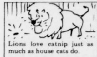
Lions love catnip just as much as house cats do.