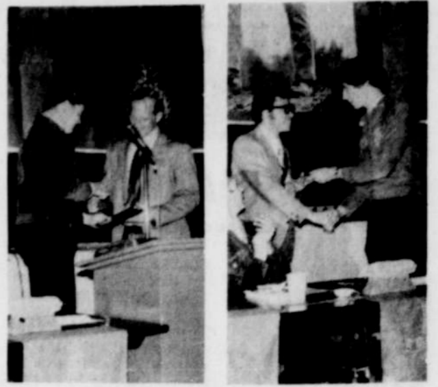
AWARDS PRESENTED AT THE Future Farmers of America banquet Friday evening are from left: