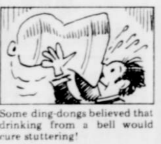
Some ding-dongs believed that drinking from a bell would cure stuttering!