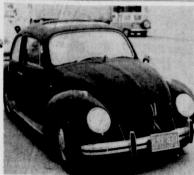
A SURE SIGN OF SPRING is this "green bug" running around the streets of Nyssa. The Volkswagen belongs to Mike Stringer and is covered with green AstroTurf. We caught a picture while it was parked on Main Street the other day, but Mike was no where to be found.