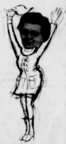
Hurray for Lower Prices!