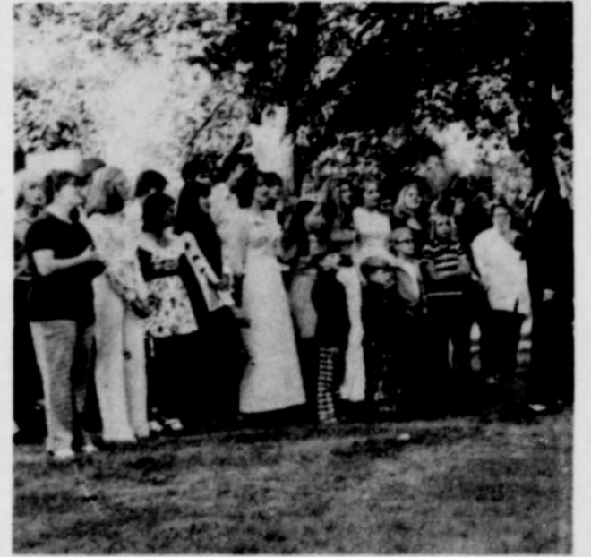
ONE OF THE MUSICAL GROUPS WHO ENTERTAINED DURING "THREE NIGHTS IN THE PARK"

The concept of a Community School is to make better use of the public school buildings by opening them for use during more hours of the day. After school and evening classes are offered for adults and school age children who may take courses not offered in the regular curriculum. Classes are offered in vocational areas, for high school completion, for enrichment, and some are available for college credit. Any subject can be offered if there are ten or more people who want to enroll, and an instructor can be found. There is no residency requirement, so people from neighboring towns are encouraged to attend.