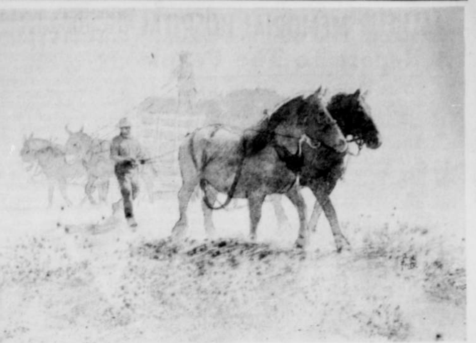
A HAYING SCENE FROM PIONEER TIMES is one of five subjects for the new Oregon Artists' Collection check series issued by United States National Bank of Oregon, now available throughout the state. Other paintings appearing in the series represent gold panning, logging, cattle ranching and salmon fishing.