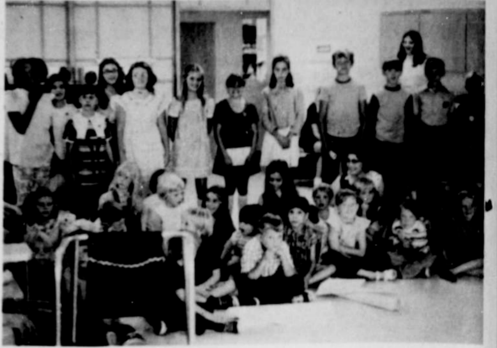
COMBINED MEMBERSHIP of the Sunday Schools of St. Paul's Episcopal Church, Faith Lutheran Church, and the United Methodist Church have been attending Bible classes during the past several weeks. Thursday they sang several religious numbers for residents of Malheur Memorial Hospital Nursing Home.