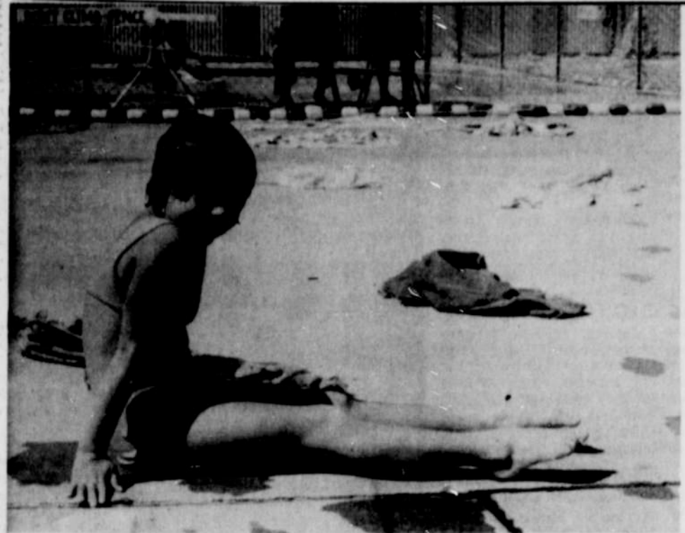
SOAKIN UP THE SUNSHINE