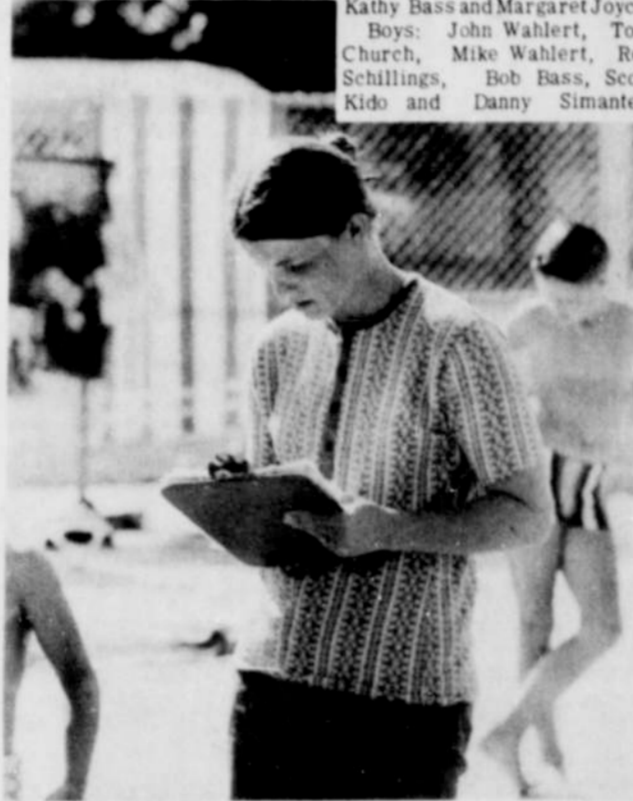
Coach Keeps Score