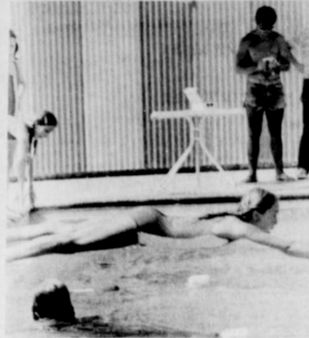
Relay Anchor Leg