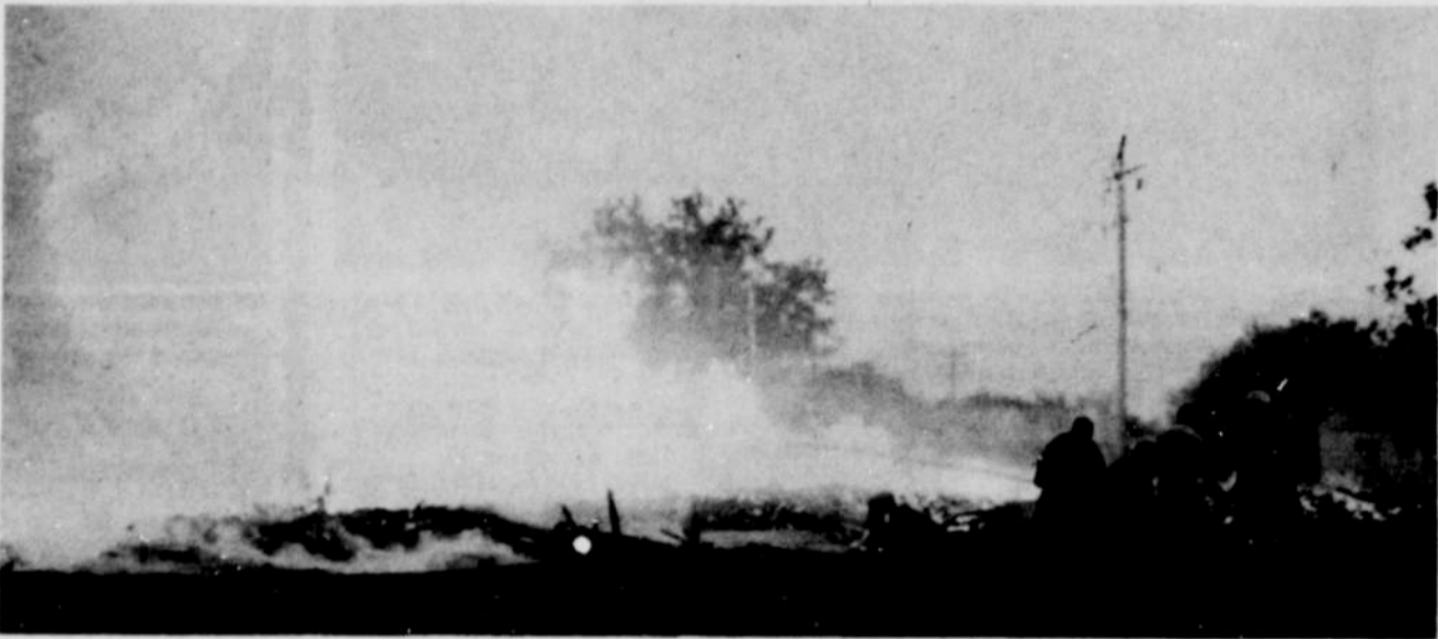
Final mop-up .