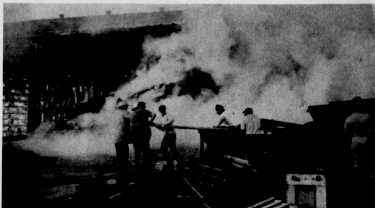
The fight is on . . . . .