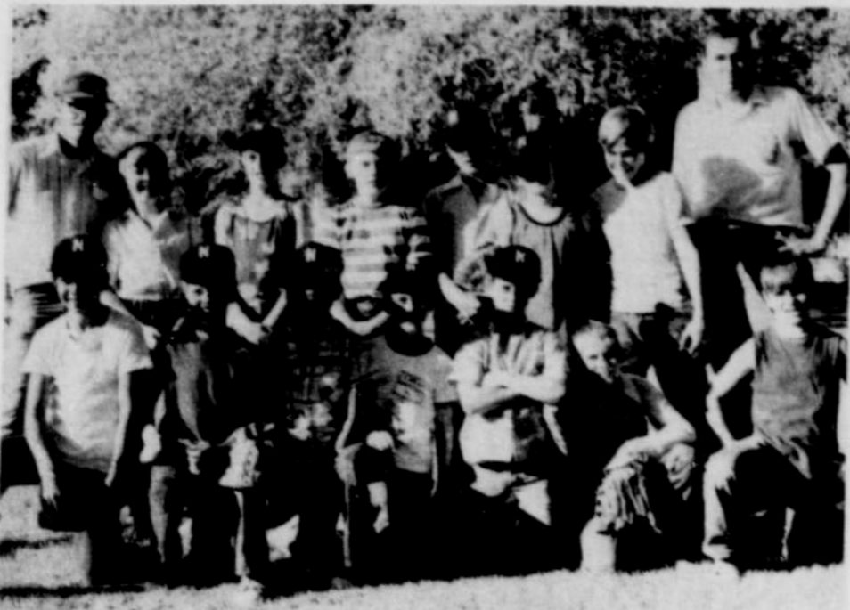
Nyssa Pee Wee Team Defeats Vale, 28-13

A tough Nyssa Pee Wee team took on the Vale Pee Wees Monday evening, June 25, and powered their way to a 28-13 win.