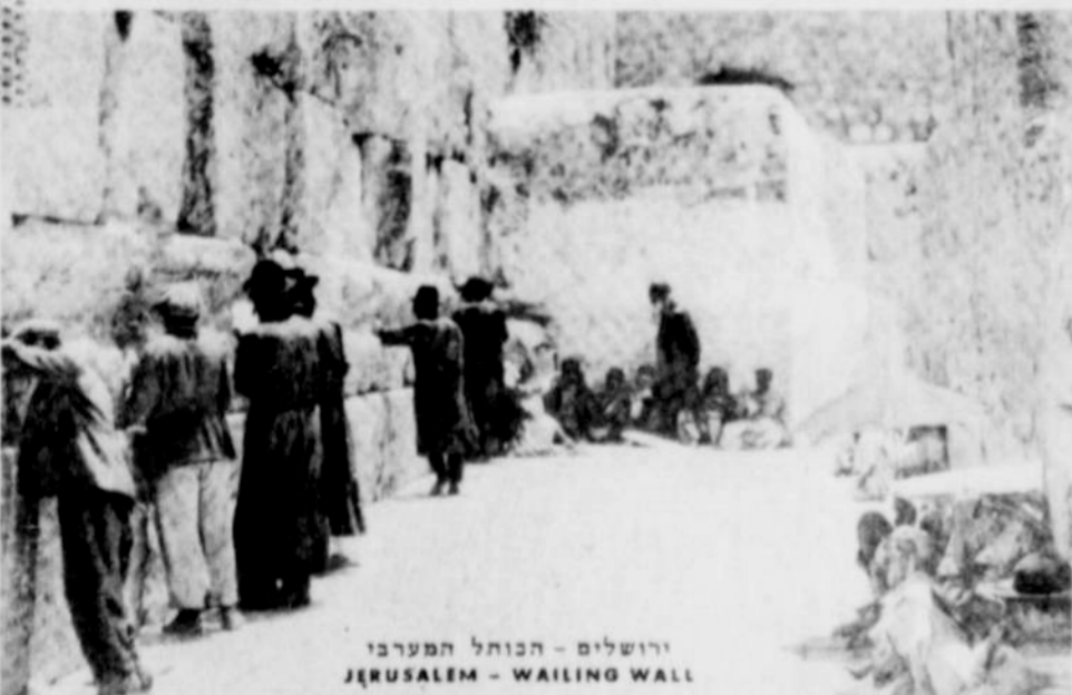
WAILING WALL IN JERUSALEM. Picture is self-explanatory.