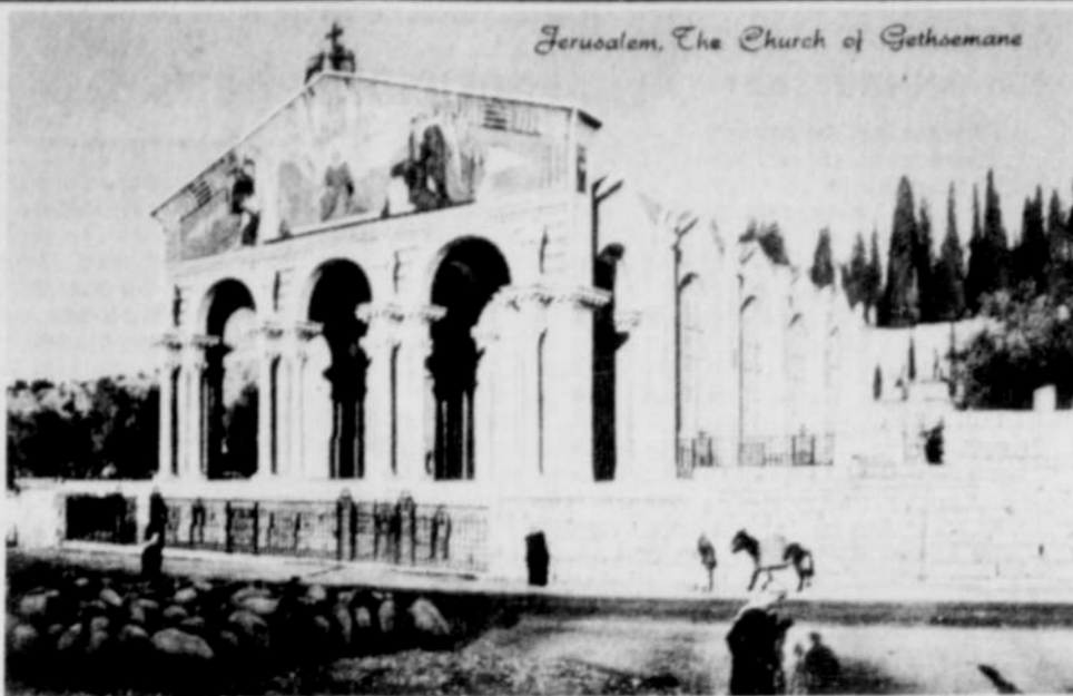
JERUSALEM - THE CHURCH OF GETHSEMANE. Church of all Nations. World wide Christian generosity contributed to the erection of this Church, hence its modern name--Church of all Nations. It was here where Jesus and his disciples concealed themselves before being led prisoner from the garden to Jerusalem.