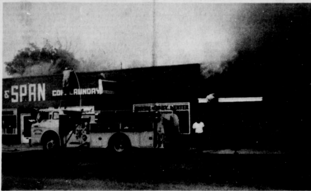
THE SPIC & SPAN CLEANING CENTER at 3rd Street and Bower Avenue was destroyed by fire Sunday evening, putting the coin-op laundry, dry cleaning and Gold Strike Stamp redemption center owned by Mr. and Mrs. Jim Tomjack out of business until they can be rebuilt.

The building contained a large amount of cleaning solvent, which is flammable under extreme heat. The burning tar and insulation created a very acrid smelling smoke, and firemen could work near the fire only with the aid of gas masks, and then only for short periods.