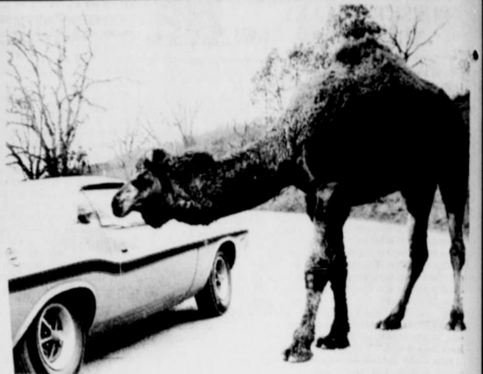
VISITOR INSPECTION AT WORLD WILDLIFE Safari has become a favorite pastime for one or two dromedaries at the Winston, Oregon reserve. This month's adoption of extended hours for summer, from 9 a.m. to 7 p.m. daily, has increased numbers

ALL TYPES OF INSURANCE INCLUDING FARM Vale Ontario Nyssa 372-3162