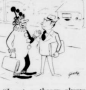
"I got a theory—always leave 'em laughing..."