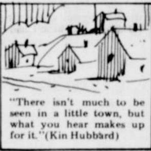
"There isn't much to be seen in a little town, but what you hear makes up for it." (Kin Hubbard)