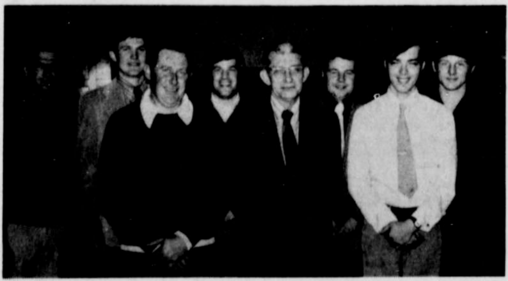
SEVEN NEW MEMBERS of the Nyssa Eagles Lodge, Aerie No. 2134, were initiated in impressive ceremonies last Wednesday evening.