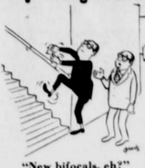
"New bifocals, eh?"

Bay, Gold Beach, LaGrande, North Bend, Ontario, Bend, Redmond, two branches in Klamath Falls, St. Helen's, Scappoose, and Florence.