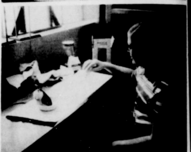
SCIENCE STUDENTS at Nyssa High School are busy preparing for their Science Symposium to be held later in the month.