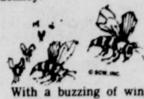
With a buzzing of wings

"Bethlehem," bleated the sheep. "Let us go!" brayed the donkey.