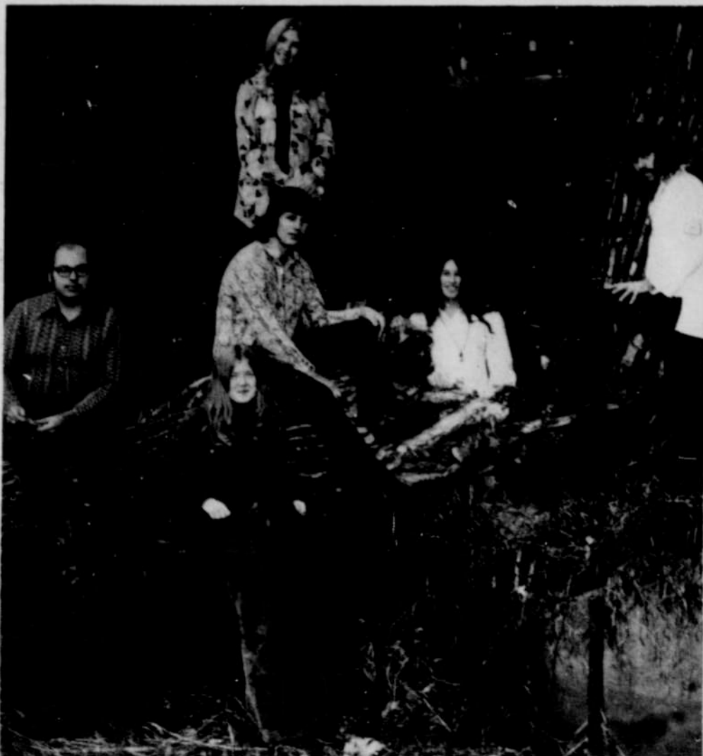
"THE SONFOLK", A CONTEMPORARY gospel singing group proclaiming the message of Jesus Christ through both modern and traditional music making use of a variety of instruments—guitar, electric piano, bass guitar, harmonica, and drums—will present a concert at the Cafeteria-Auditorium of Nyssa High School, Sunday evening, October 29, at 7:30 p.m. "The Sonfolk" are from Concordia College of Moorhead, Minnesota, and are currently on a year-long tour which will take them all over the United States. The group has traveled extensively, singing at churches, parks, jails, nursing home, and teen rallies. They have cut two record albums, which will be available for purchase. A free will offering will be received. The concert is open to the general public and is sponsored by Faith Lutheran Church of Nyssa.

Faith Lutheran Church is celebrating its 25th anniversary on October 29, and "The Sonfolk Concert" is intended as a gift from Faith to the community of Nyssa and the Treasure Valley area and in gratitude to God for the twenty-five years of Faith's life and ministry. It is hoped that the auditorium will be filled to hear this excellent group as they sing the praises of our Lord.